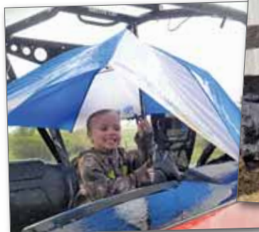
Caught in the rain

Here is a heifer bull that also goes back to the 424B cow, his dam is a nice long bodied cow with a tidy udder and great feet. He is long bodied and smooth and will be able to cover big country. With a 69 lb. birth weight he is heifer safe and at weaning time he had an actual weaning weight of 615 lbs. at 199 days of age from a 2-year-old heifer.