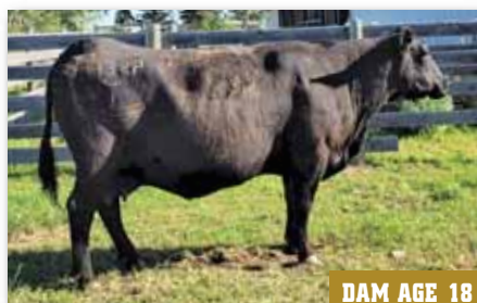
DAM AGE 18