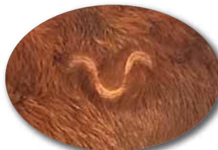
The Flying U

Red Blood son with loads of hair and hip, calving ease but should not compromise weaning weights in the fall. Dam is a young Mission Statement daughter from Max 6253 grandam. Lots of cow makers in this pedigree.