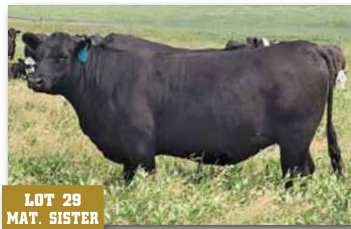
LOT 29 MAT. SISTER