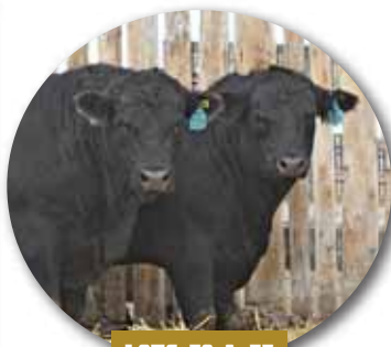
LOTS 32 & 33