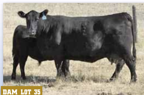
DAM LOT 35