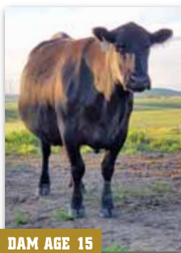
DAM AGE 15