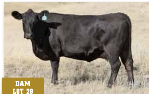
DAM LOT 29