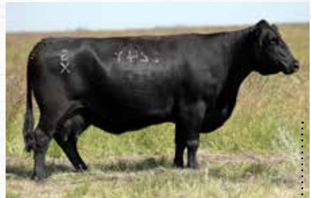
DAM | 224Y