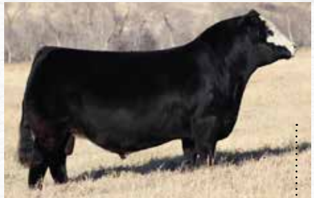
SIRE | TRUE NORTH