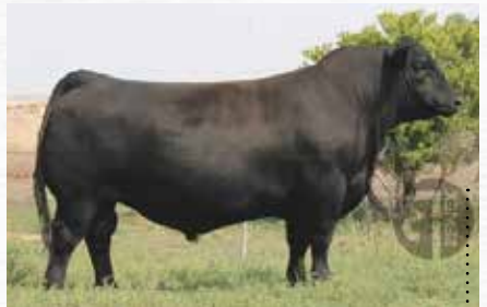
SIRE | ATTRACTIVE 4565