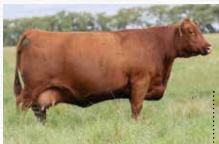
DAM | 434A