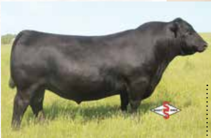
SERVICE SIRE | RAINFALL 6846

AI bred to S A V Rainfall 6846 - April 20. Preg tested safe.