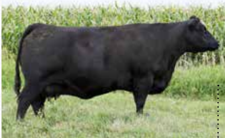
DAM | 12B