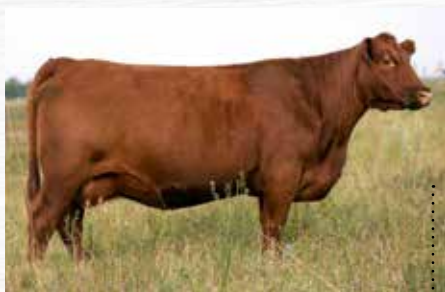
A SAMPLE OF THE RIPZONE FEMALES

AI bred to Red 9 Mile Franchise 6305 - 2017139 - on April 20. Preg tested safe.