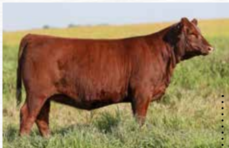
Lincoln Daughter | sold to Wilbar Cattle Co. :