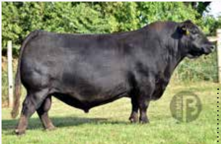
SERVICE SIRE | COLOSSAL 137

AI bred to Musgrave Colossal 137 - 2021884 - April 20. Preg tested safe.