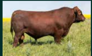
RED MOOSE CREEK RIPZONE 89D -1943154 -