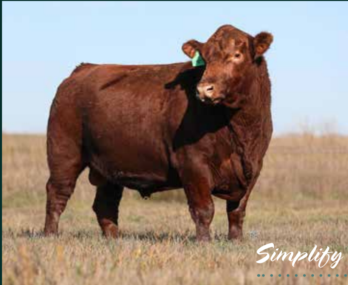
RED COCKBURN SIMPLIFY 1104 -2245233-

This exciting young sire is the service sire to several of the Red Angus females. You must admire his phenotype, calving ease, and beautiful front end. His dam goes back to the Cockburn Cora family who have been top producing cattle in the Cockburn program. We are impressed with the birth weight of his first offspring and yet the strong quarter and style to his calves. This bull has a lot of future ahead of him.