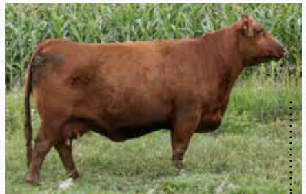
GRAND DAM | 65X