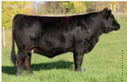
GRAND DAM | 202E