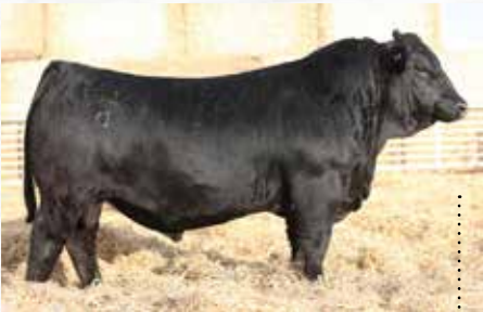
SERVICE SIRE | NIGHT HAWK