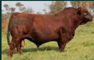
RED BLAIR'S NAVIGATOR 37E -2016094 -