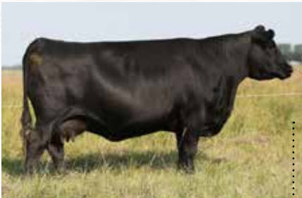
DAM | 13B