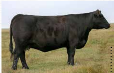
DAM | 72G :