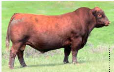
FULL BROTHER | LINCOLN 106H