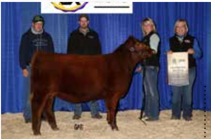
DAM | 10D