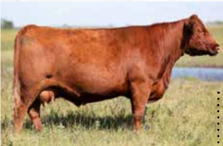
GRAND DAM | 109B