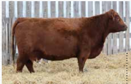
DAM | 443A