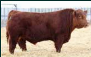
RED MRLA ADMIRATION 29J - 2193501 -