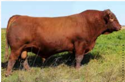
SIRE | UTAH WHISKY