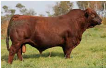
SIRE | NAVIGATOR 37E